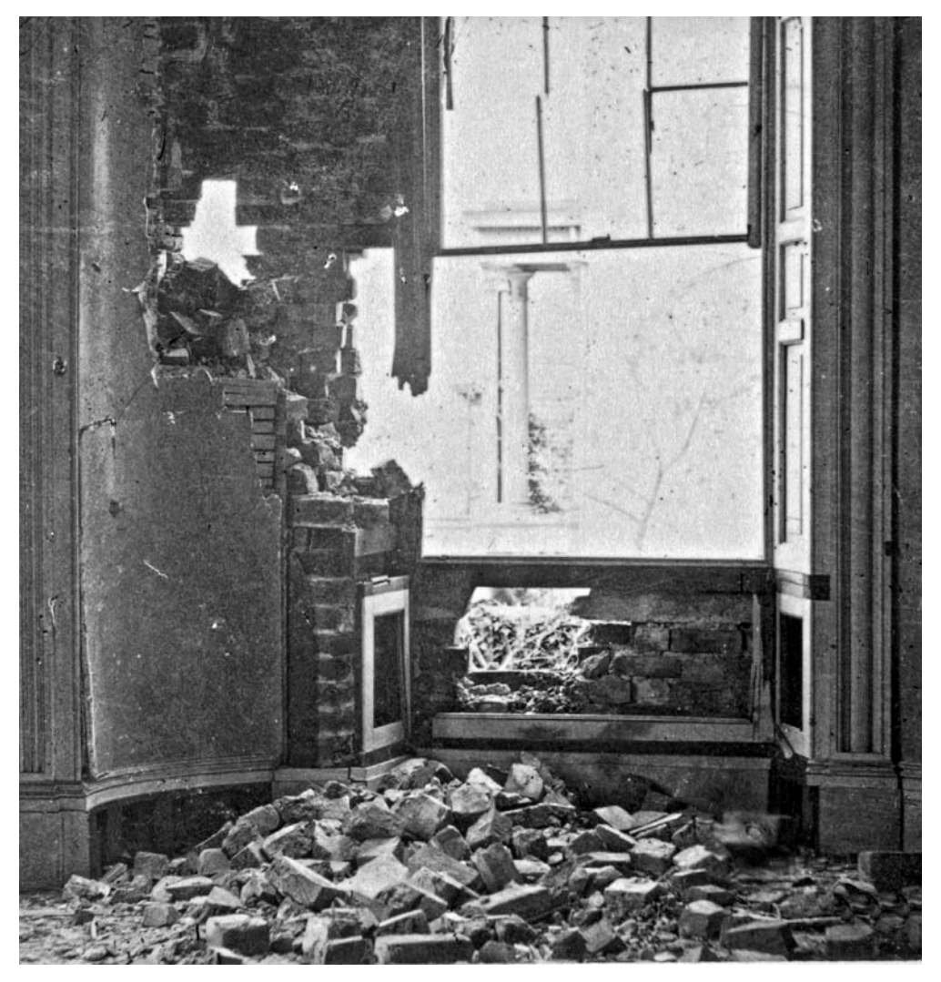
As an author who lived with the Civil War at close hand, Rebecca Harding Davis not only "saw both sides" but also saw the sordidness of the war and of the men—and women—involved in it. A parlor window on Bollingbrook Street, Petersburg, Virginia, 1865, where a shell from the Union batteries struck, courtesy of the Library of Congress.